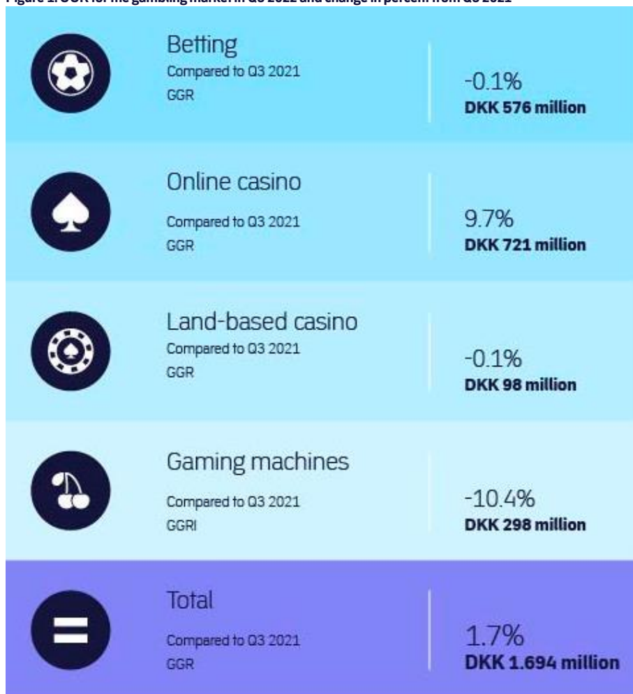
Figure 1. GGR for the gambling market in Q3 2022 and change in percent from Q3 2021