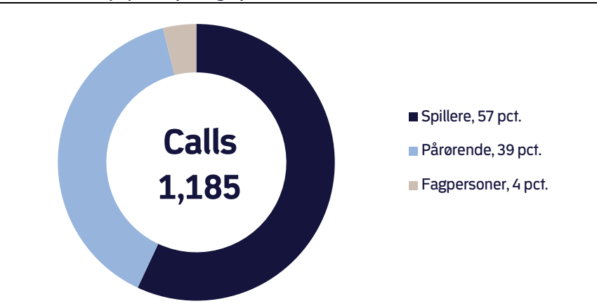
Figure 1. Calls to StopSpillet by category