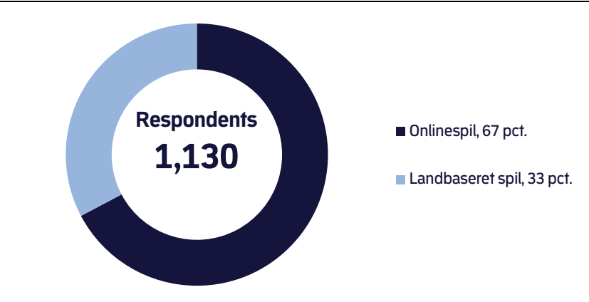
Figure 3. Players' problem games