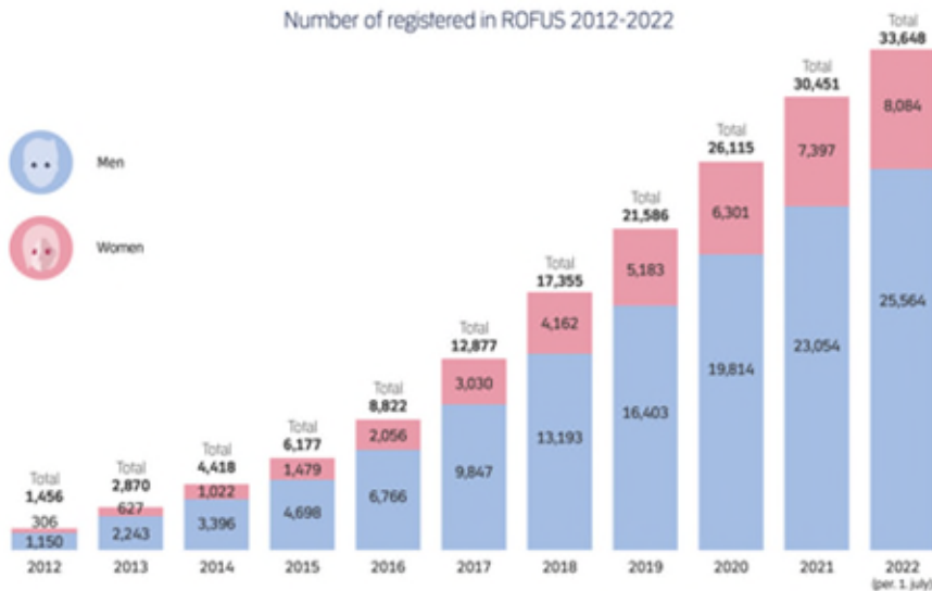
Figure 2. Players registered with ROFUS categorised by sex, 2012-2022

Via the Danish Gambling Authority's register of self-excluded players (ROFUS), Danes can self-exclude from online gambling and gambling at land-based casinos either temporarily for 24 hours, one, three, or six months, or permanently. Every year since the establishment of the register in 2012, the number of self-excluded players has increased, cf. figure 2 . As of 1 June 2022, the number of players registered with ROFUS was 33,648. 25,564 of the registered players were men. This equals 76 percent.